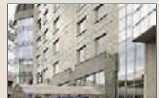
Novotel Moscow Centre - Moscow