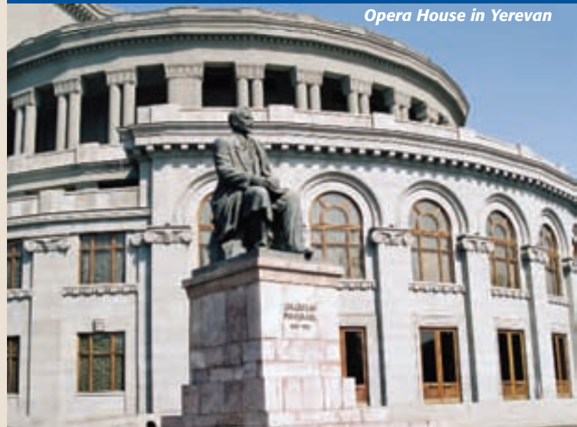
Opera House in Yerevan

* Tour prices shown are based on Los Angeles departure and for double occupancy. Departures from all U.S. cities are available. Please call (800) 826-7960 for details and pricing.