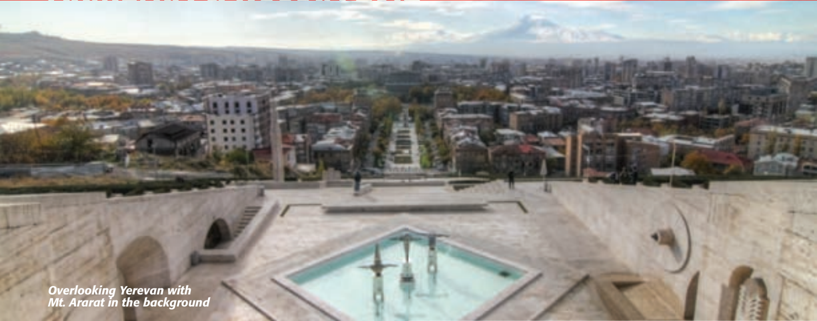
Overlooking Yerevan with Mt. Ararat in the background